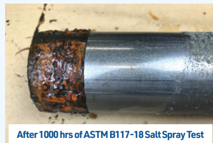
After 1000 hrs of ASTM B117-18 Salt Spray Test