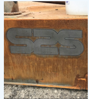
AFTER 6 months exposure on Gulf of Mexico