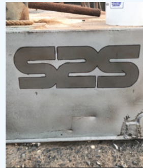
BEFORE Sandblasted white metal

S2S HD Corrosion Shield bonds to metal for long lasting adhesion. It does not typically need to be removed before reactivating equipment but if desired simply wash with a high pH detergent and water.